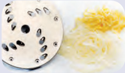
ø6mm holes Item 40953