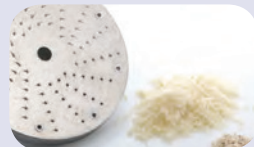
Specific disc for parmesan, dried fruits, peanuts (very fine) Item 40955

A WIDE RANGE OF DISCS To Grate Everything