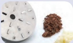
Specific disc for fondue, mozzarella, chocolate Item 40956