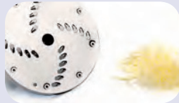
ø4mm holes Item 40952