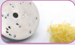
1 Standard Disc Included ø3mm holes Item 40951