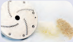
ø2mm holes Item 40950