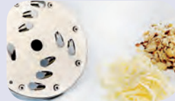
ø8mm holes Item 40954